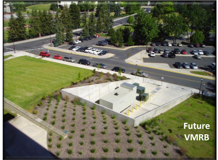
Site of the new Veterinary Medicine Research Building (VMRB; ABOVE LEFT) prior to ground-breaking ceremonies (red arrow). The proposed building will house VCAPP and Neuroscience administration offices and research space. Biotechnology/Life Sciences (BLS) building spine (black arrow) is site where future VMRB will connect. (ABOVE RIGHT) Shared dock in front of VMRB construction site.