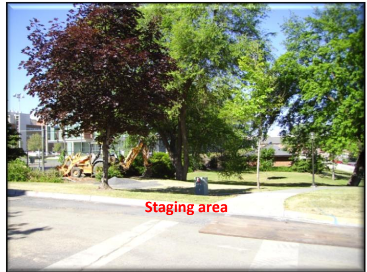
Aerial view front (MIDDLE PANEL L) and rear (MIDDLE PANEL R) of proposed VMRB site. (BOTTOM LEFT) Corner of existing BLS building conceals future VMRB site, beyond red arrow and existing trees. The VMRB will neighbor BLS on the south, coliseum parking to the north, Stadium Way (and WSU football stadium across street) to the west, and Food Science (housing Ferdinand's ) to the rear. (ABOVE RIGHT) Rear/staging of south building site, looking back from Food Sciences/Human Nutrition building. The lonely front loader behind the tree seems to be waiting patiently to begin this exciting new project.

Aerial views taken from 4 th floor balcony of existing BLS complex