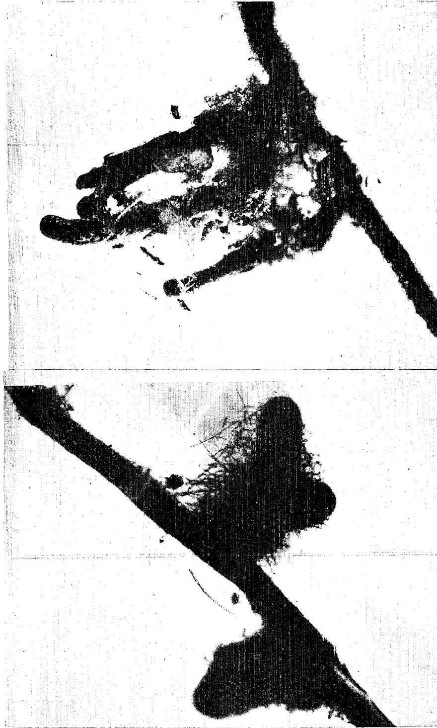
Figure 3. Left, dignitate mycorrhizae, Cenococcum graniforme ; right, racemose mycorrhizae, unknown species.