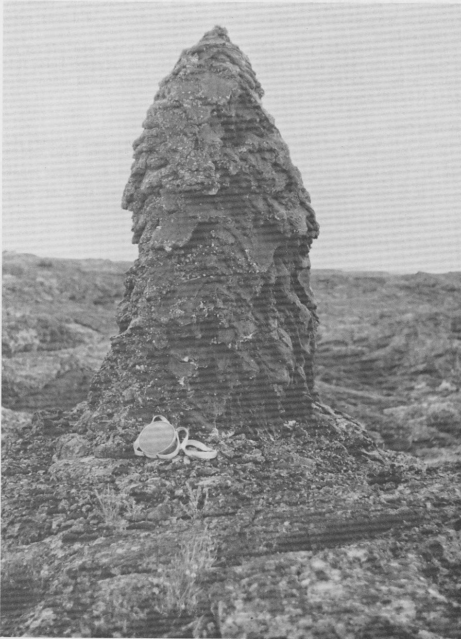
Figure 2. Dribblet spire on Pillar Butte Flow, showing typical imbricating slabs of pahoehoe lava. Half-gallon canteen at base indicates scale.

dribblet spires would have been eroded, possibly beyond recognition, in consideration of the great age of lunar mare surfaces (3.3 billion years, compared to less than 1 million years for the Wapi Lava Field). Lunar areas such as the Marius Hills