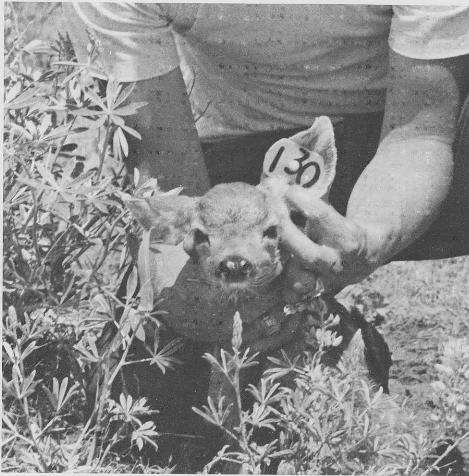
Figure 2. A captured fawn which has been fitted with ear tags.

session of intensive tagging, had limited success for the three-day effort, since the tagging crew and the helicopter pilot were inexperienced in the pursuit and capture of fawns. Twenty-four fawns were captured. The next four years—1970, 1971, 1972, and 1973—yielded 51, 52, 53, and 48 fawns, respectively. Only 34 fawns were tagged in 1974 when the entire operation was hampered by hot weather and the dense vegetation brought on by an unusually moist spring.