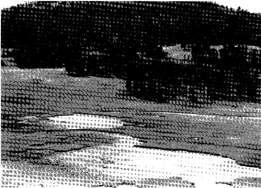
Figure 2. Burned-out sedge meadow in Yancy's Hole near Tower Junction on Yellowstone National Park's northern range in 1989. Prior to the 1988 fires, this area was a continuous sedge meadow with no openings. The burned-out areas were covered with standing water until mid-June 1989. The aspen seedling belt transects are located in the lower-left center.