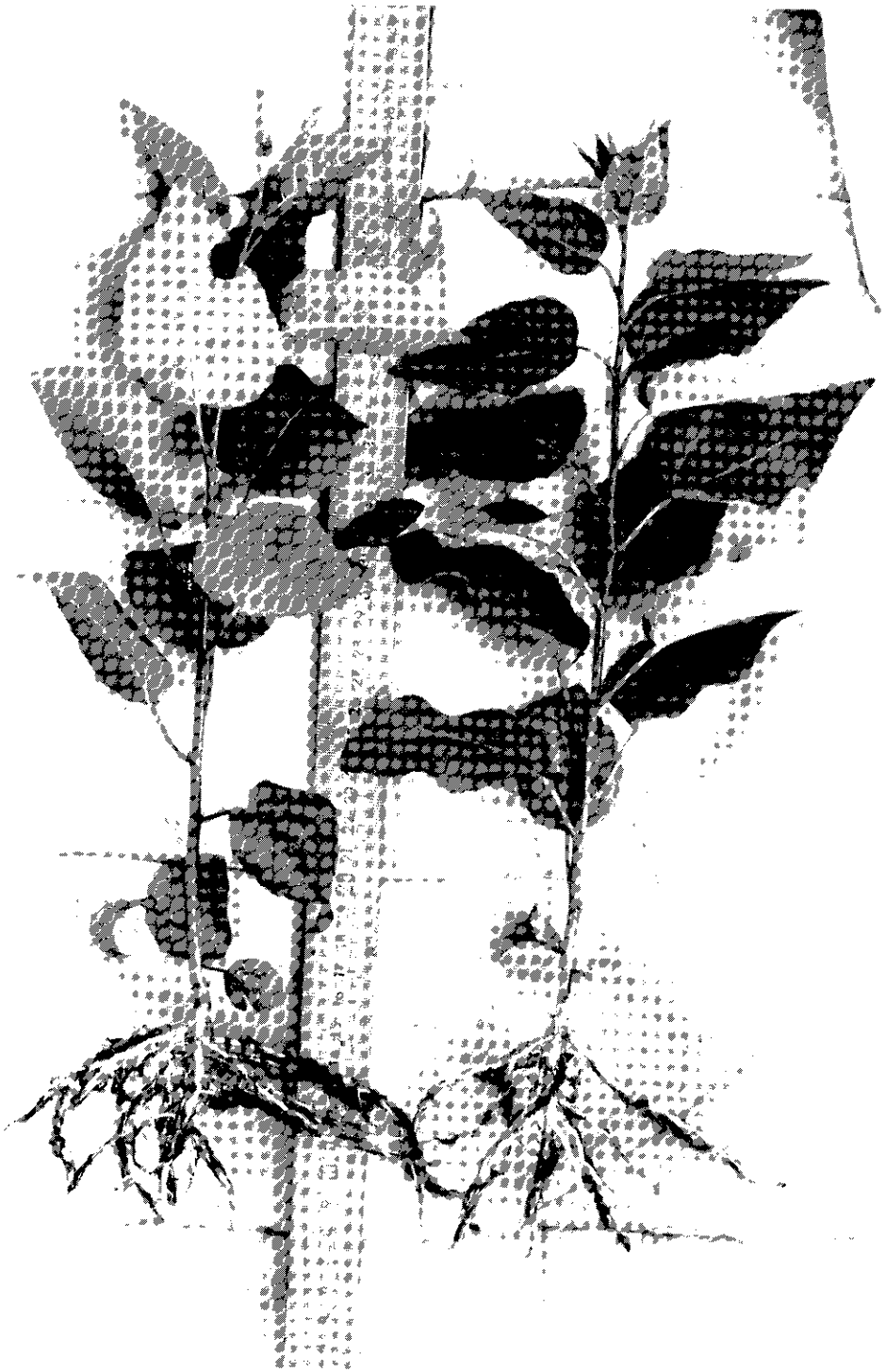
Figure 1. Closeup of unbrowsed 3-month old aspen seedlings collected in 1989 from Yancy's Hole on Yellowstone National Park's northern range. Note the root structure where numerous fibrous roots originate from a central tap root and the absence of any suckering lateral roots. Meter stick for scale.