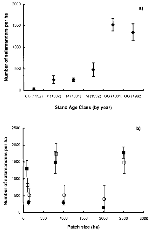
Figure 1. a) Relative densities of Plethodon vehiculum in stands of different ages. Values plotted are means and standard errors of 9 replicates (3 2-ha plots at each of 3 sites per age class). Recent clearcuts had only 4 replicates (Table 1). CC = clearcut (5 yrs), Y = young (17-18 yrs), M = mature (54-72 years), OG = old growth (300+ yrs).

There was little difference among proportions of hatchlings, juveniles, and adults with forest age class (Figure 2a). Across all years and forest ages, hatchlings represented 13% to 23% of the sample and juveniles usually comprised 11% to 26% (in 1992 they represented 40% of the mature second-growth sample). Tests of proportions revealed no significant differences in age class distribution with either forest age class or patch size ( p > 0.3 ). There was, however, an apparent effect of stand adjacency. In 1991, mature managed stands with adjacent old growth had 13.2% young