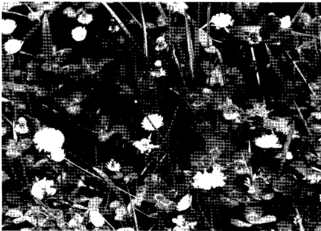
Figure 4. A typical ruderal community in the middle of a little used dirt road during the late spring. The dominant species in this aggregation are Trifolium repens and Bellis perennis .

sula of Washington are strikingly different in structure and ecological characteristics from those along the edges of the deciduous forests of Europe (Moravec et al. 1982), where much of the ruderal vegetation has had its origin. Table 2 provides a short list of some of the dominant native plant species of the forests on the Olympic Peninsula, which were characterized by Franklin & Dyrness (1973) as being mainly old growth forest, dominated by Sitka spruce ( Picea sitchensis ) and western hemlock ( Tsuga heterophylla ) and notable for the dense epiphytic flora. In addition to the abundant mosses (Schofield 1992), which coat much of the forest floor and the tree trunks, the vegetation is characterized by a particularly large variety of lichens (McCune & Geiser 1997). For this reason, the demarcation lines between the introduced community (Figure 4) and the native flora (Figure 5) are recognizable at a glance. In eastern North America, there is less distinction between the native and non-native vegetation because many of the introductions occurred well