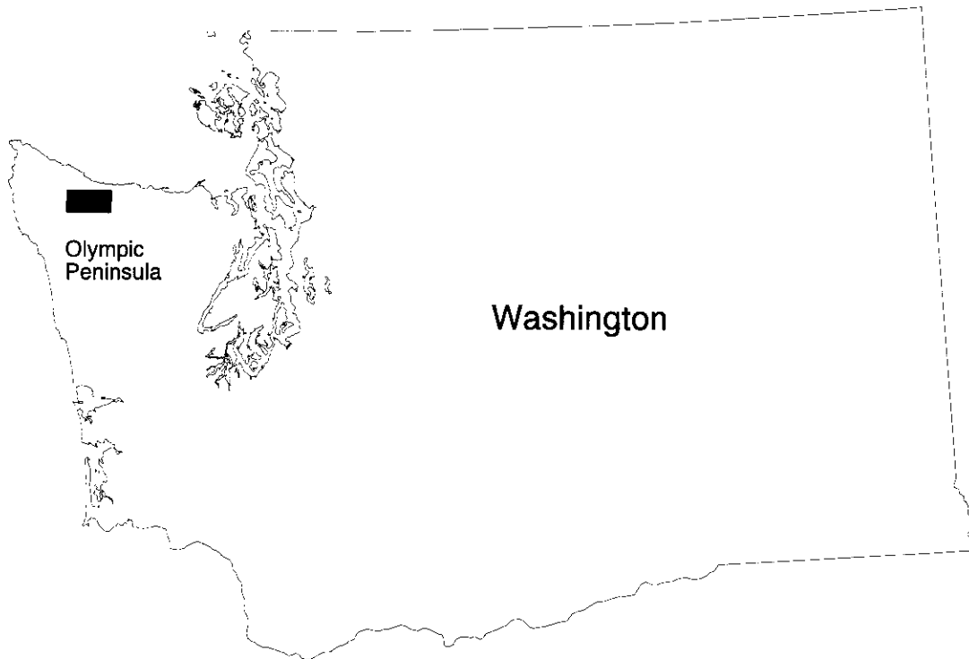
Figure 1. The location of the site surveyed (black rectangle) on the Olympic Peninsula in the State of Washington.

The cartography of the vegetation was completed using recent aerial photos of the Sol Duc River Valley and parallel ridges in or adjacent to the Olympic National Forest. The regional vegetation was observed on the ground, and the structure of the various plant communities was determined.