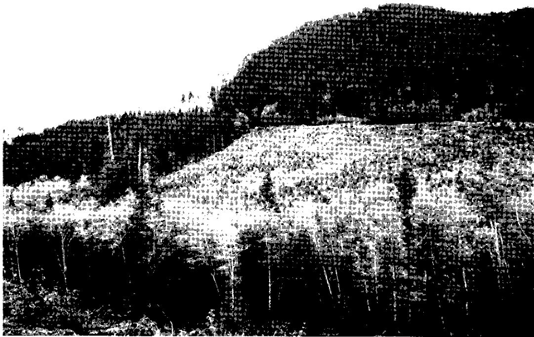
Figure 2. Hillsides near the site of the survey in Clallam County showing typical closed forest and clearcut areas. A transect through the center of this photo from top to bottom reveals the "all or none" nature of exotic species aggregations in the local herbaceous flora. In contrast, the woody plants belong almost exclusively to native species. For details, see text.

they persisted on unused roads and former clearings that had been fully overshadowed by young conifers.