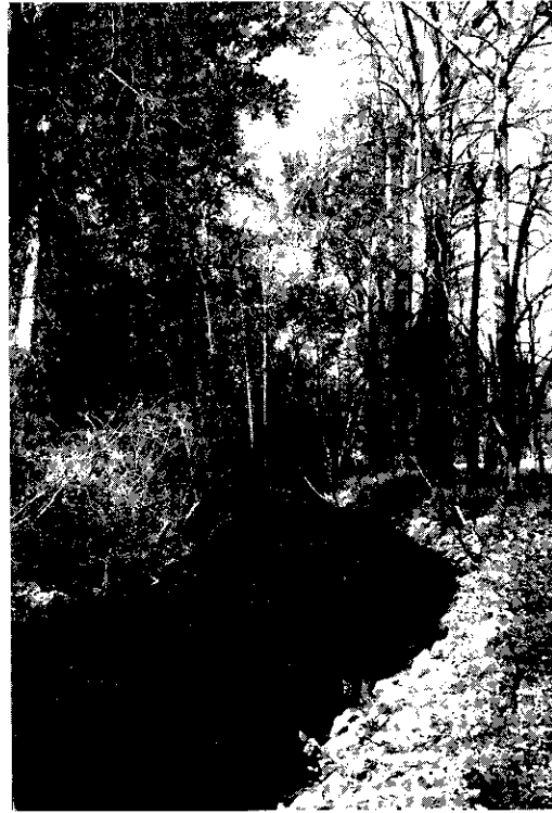
Figure 3. Same view of riparian vegetation in June 2000. Leafy crowns have returned to trees on the right bank (left side of photo), and to some of the large cottonwoods on the left bank. The two large cottonwoods in the left bank foreground have produced root sprouts. The char collars visible on these large trees are 11-15 m high. Snowberry is the most abundant species in the understory in the right foreground.