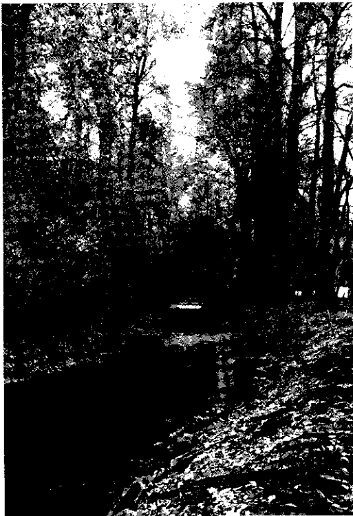
Figure 2. Upstream view of the burned riparian community along Whatcom Creek, July 1999. Fire severity was greater on the left bank (right side of photo), as indicated by high crown scorch volumes, heavy bark scorch, and burned understory. The large trees on the banks are black cottonwoods; initial flame heights cleared the tops of these trees. The smaller trees along the water on the left bank are dead red alders.