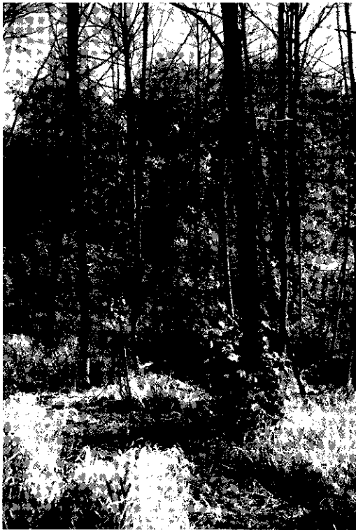
Figure 4. Top-killed bigleaf maple on the left bank, resprouting from the root crown. Dead red alders on the left bank are visible behind the maple. In the background are leafy crowns of black cottonwoods, bigleaf maples, and red alders on the right bank. Grasses in the foreground were killed by postfire herbicide applications associated with rehabilitation efforts.

Creek joined Whatcom Creek (Figure 1). Gasoline that had flowed into Cemetery Creek also ignited, so that this cottonwood was surrounded by flames, in contrast to all other cottonwoods in the burn zone.