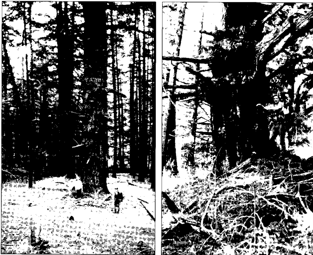
Figure 2. Two views of relict Douglas-fir on the south face of Mount Constitution, exhibiting characteristic open-grown form including large bole diameter and large lower branches. Note the high density of younger trees in the background.

Douglas-fir, (2) glades, and (3) relict glades, which contain a forest overstory and an understory with some vegetative characteristics of glades.