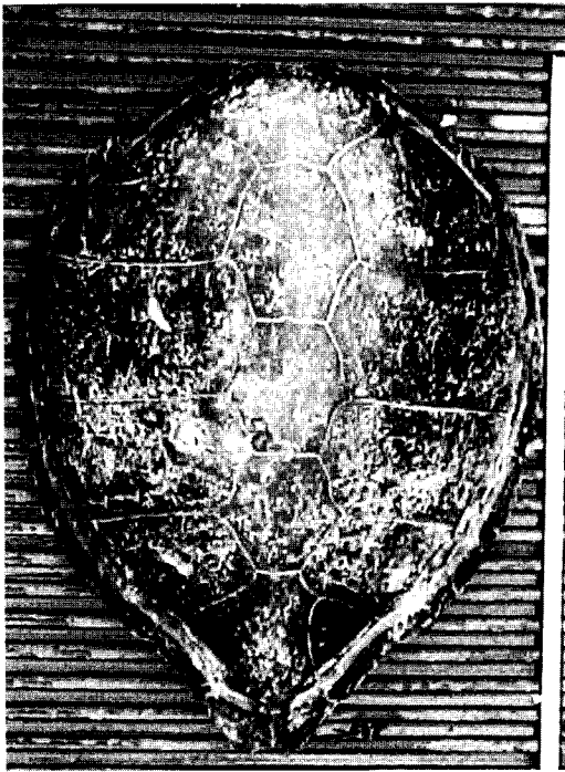
Figure 2. Carapace of a fresh 71 cm green turtle carcass washed ashore near Rose Spit, Graham Island, British Columbia on 9 November 1999.