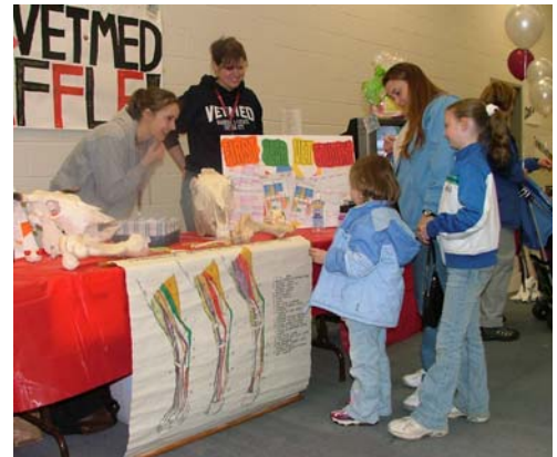
Class of 2009 students teach an Open House visitor about a horse's leg.

**This event is separate from the D.V.M.@WSU recruitment event. **