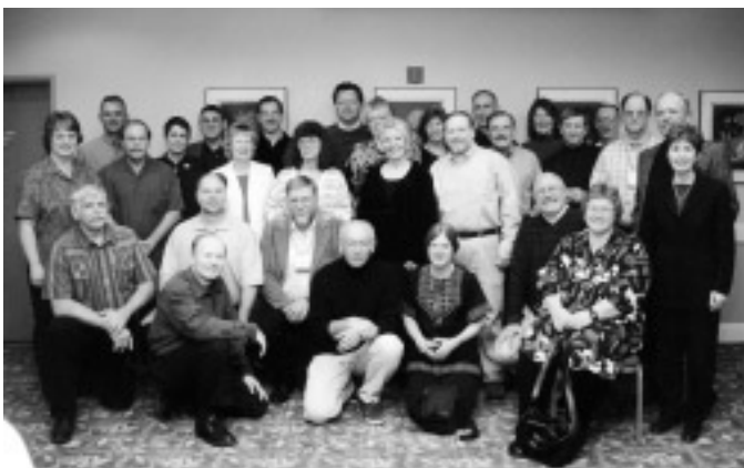
Class of '73