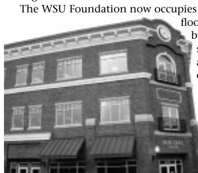
The new WSU Foundation Office located at Towne Centre, 225 E. Main Street in Pullman

The Washington State University Foundation recently moved its headquarters off campus to downtown Pullman in the newly constructed Town Centre building. The move took place during the last week of March and continued through April.