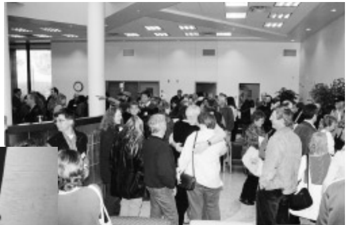
"So good to see you!"